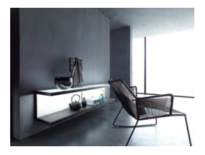
GERA wall shelf 100