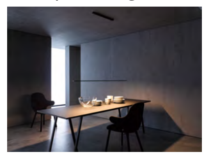
GERA pendant light 40x10