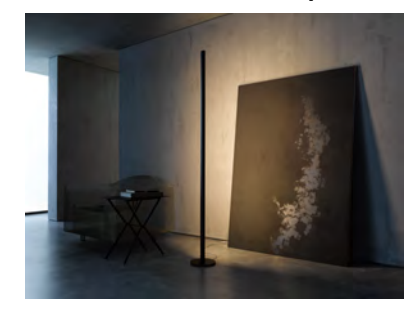
GERA standard lamp